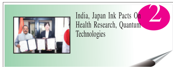
India, Japan Ink Pacts On Health Research, Quantum Technologies