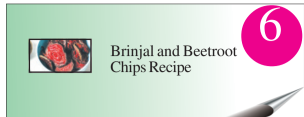
Brinjal and Beetroot Chips Recipe