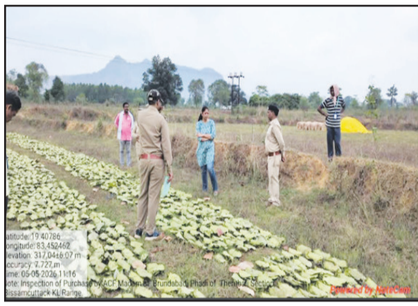
Inspection of Kendu leaf procurement and transportation across multiple phadis under the Bissamcuttack KL Range. The ACF emphasized the importance of transparency in procurement practices and directed staff to avoid any irregularities. The transportation system was also examined to ensure that leaves are

procurement process, interacted with field staff, and assessed the quality and storage conditions of the collected Kendu leaves. Special attention was given to verifying whether standard procedures were being followed during collection, bundling, and transportation. Officials were instructed to maintain proper records and ensure timely payments to pluckers, many of whom belong to tribal and rural communities dependent on Kendu leaf collection for their livelihood. The ACF emphasized the